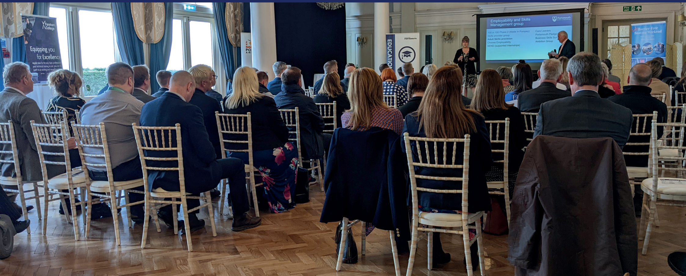
Above: Portsmouth Business Leaders Forum at The Queens Hotel

To empower businesses in our city, enabling them to flourish. We strongly advocate for inclusivity, ensuring that every corner of our business community is represented. We guide aspiring business leaders towards valuable partnerships, providing them with access to comprehensive support networks. Additionally, we proudly highlight the achievements of our city, showcasing Portsmouth as a vibrant and thriving hub for starting and expanding businesses.