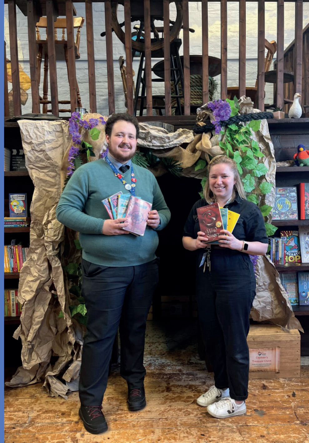
Above: Charity Support Network with Trafalgar School and Literacy Hubs