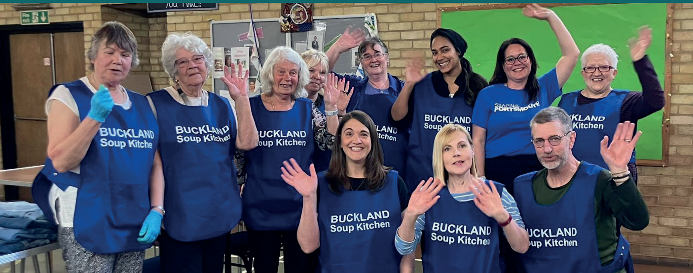
Above: Charity Support Network at Buckland Soup Kitchen

The community pillar of Shaping Portsmouth is focused on supporting the people that live, work and study in the city. We are uniquely positioned to focus our energy on emerging areas of concern, whilst providing two key programmes that showcase the best of what Portsmouth has to offer.