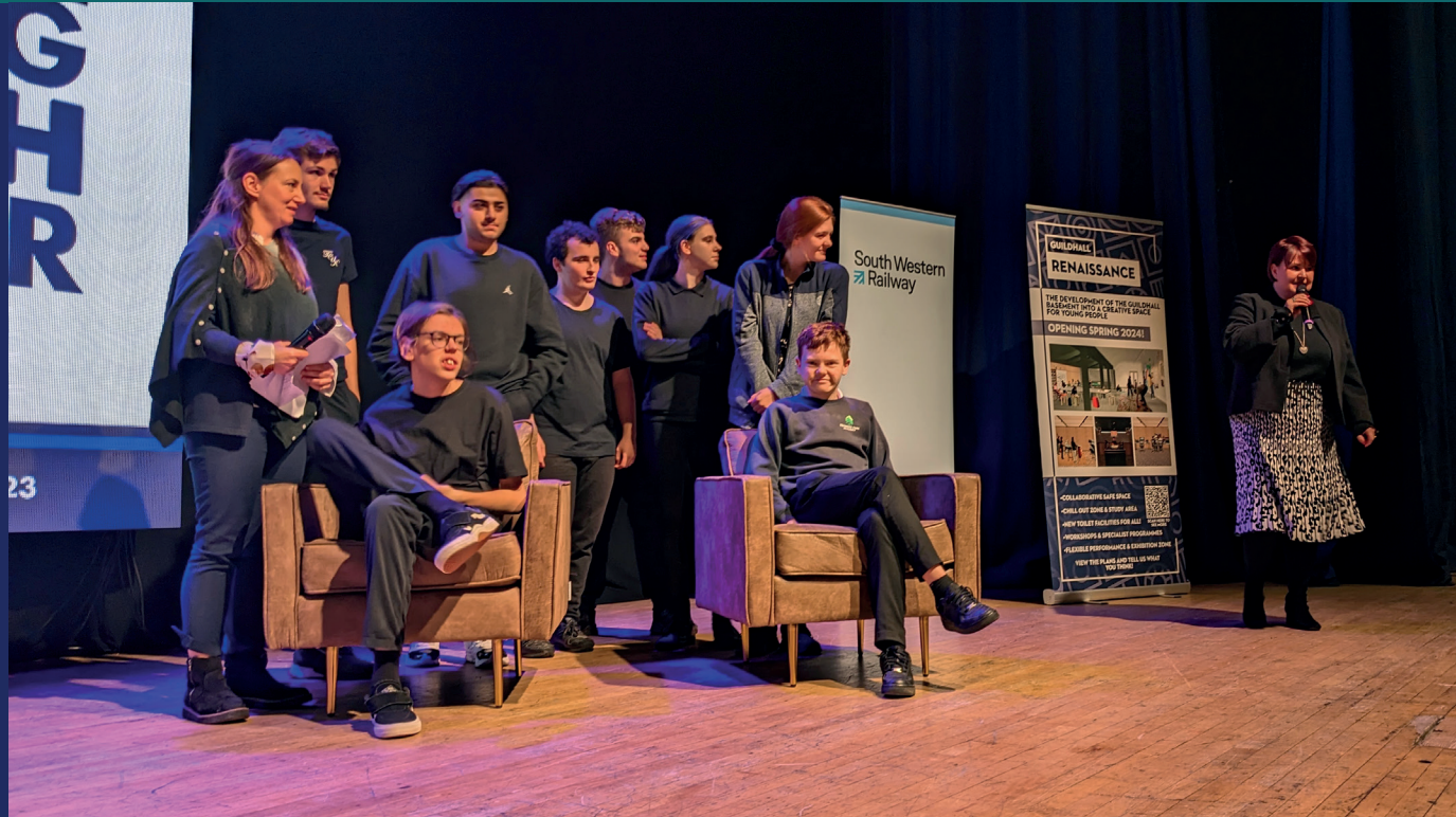
Above: Winning Shaped By Solent team at our 2023 Annual Conference

TO CREATE SUSTAINABLE COLLABORATIONS AND INNOVATIVE PROGRAMMES WHICH MAKE PORTSMOUTH BRITAIN'S PREMIER WATERFRONT CITY IN WHICH TO INVEST, LIVE, LEARN, WORK AND VISIT.