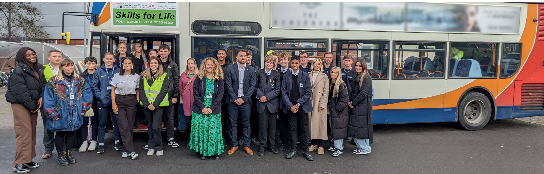
Above: Apprenticeship Roadshow 2023

Shaping Portsmouth helps the people of Portsmouth to Explore Their Future.